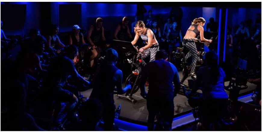
A Peloton spin class

14. Spin bikes have become immensely popular in recent years because of the community and motivation provided by spin classes. These classes are typically held at a gym or workout studio, where multiple spin bikes are placed in a room, usually close together, with an instructor in front: